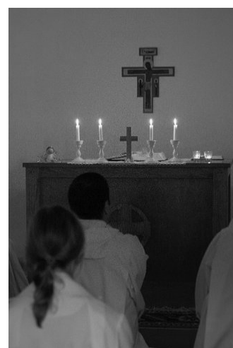
A moment from a Taizé prayer with the brothers from Taizé.

As our diaconal work expanded in 2014, we started a prayer group for people in need, today known as "Mealtime with Bible and prayer", where feeding the body and soul go hand in hand.