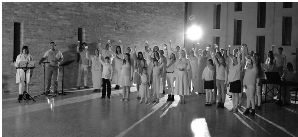
Mission Choir recording a video for a song "Önnistegija" in November 2020.

The Mission Choir wishes to share the life-altering message of Divine Love through their lyrics and music.