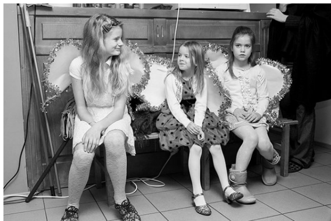
Children playing angels in a nativity play.

Cooperation with several organizations and institutions (e.g Bethel's Centre of Pastoral Care in Tallinn) has shown us that Magda Mission Shop is a trustworthy and acknowledged partner. Yet, we are still in need of support from our good friends, so that we can continue helping people with clothes, furniture and home electronics. We are grateful for all donations and we accept contributions at the shop as well.