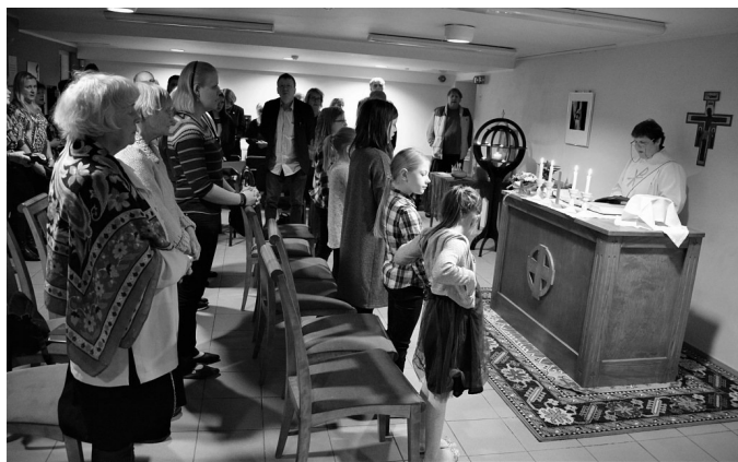
Tammsaare rd 135 basement after renovations.

These were happening even before we were officially founded. In 2009 they took place once a month. After moving into our own rooms in 2010, on every Sunday. In 2011 we started our monthly family services on a regular basis. In addition, we have a mass on the biggest Christian holidays.