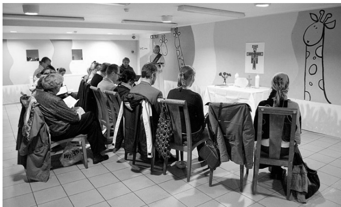
Tammsaare rd 135 rooms after moving in.

The beginning of Mustamäe congregation can be traced back to September of 2010 , when the cell group met for the first time. Five adults and one child came together to start praying for starting a new congregation. We sat at a lunch table and dreamed of a congregation in Mustamäe. We read Luke 10:1-11 how Jesus himself sent his disciples to spread the gospel and discussed among ourselves how we can do the same in 21st century Estonia. For the next couple of years the cell group met every week. It was an important time of growth, for from these meetings grew the core of the congregation - people who are ready to take the responsibility of building up a brand new congregation.