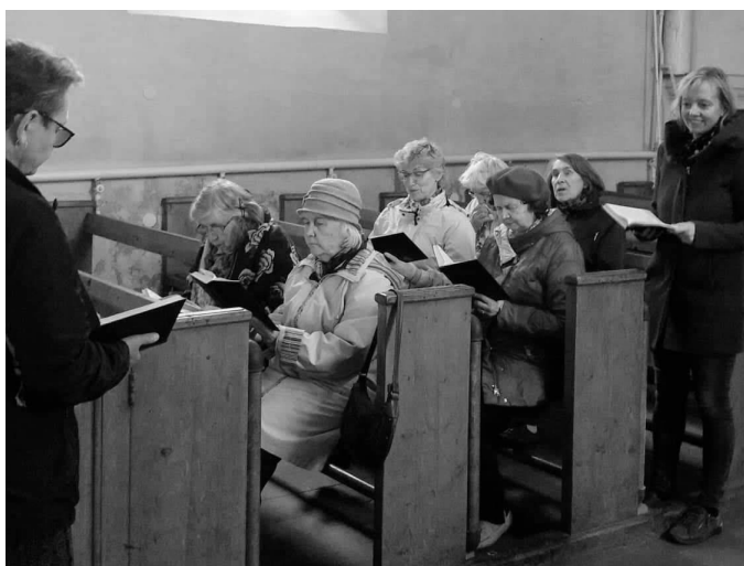
Enthusiastic and active elderly visiting Harju-Madise congregation.

In 2010 we started meetings for the elderly people, which has grown into a group of "positive and active