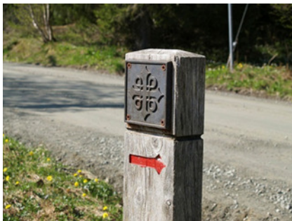
A Pilgrims Waymarker

TRONDHEIM INTERNATIONAL OLAVSFEST is a week of festivities and folklore which takes place each year (COVID permitting) either side of St Olav's Day, which is 29th July. There are quality concerts and conversations, pilgrim walks, worship services, special food and all kinds of cultural experiences that are colourful and pleasing both for body and soul. Our conference sessions will include sampling some of what is on offer.