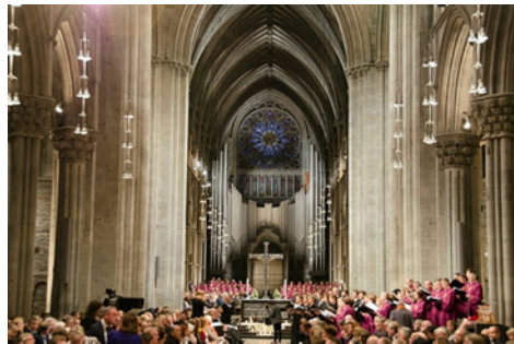
Worshippers in Nidaros Cathedral